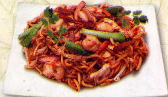
House Special Lo Mein