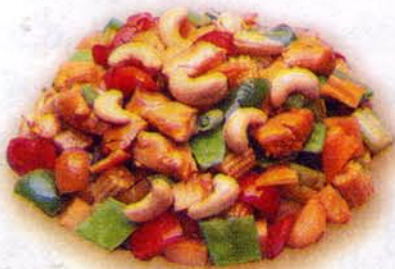
Chicken w. Cashew Nuts