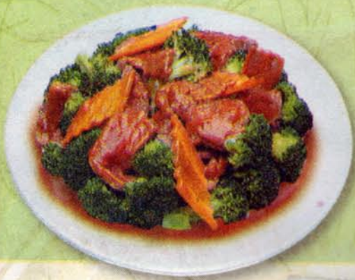
Beef w. Broccoli